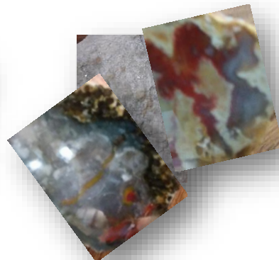
"I Bought It"