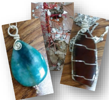
"I Made It"