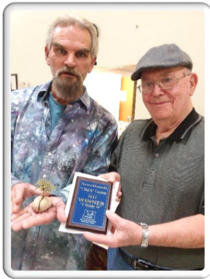
"I Made It"