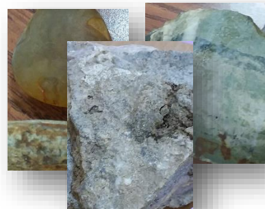
"I Found It"