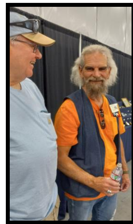
“The Man” taking a minute to relax.