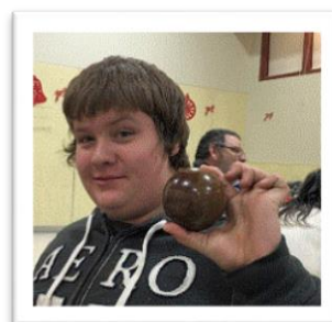
I Found a Nice One In My Stocking