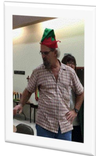
A Happy Little Guy Amongst a Couple of Elves