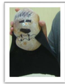
Food for thought. . .