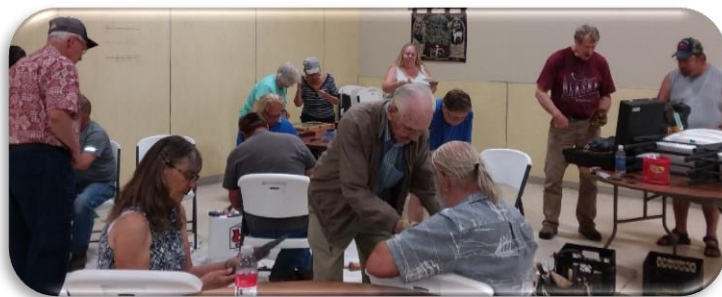
A Good Time Was Had By All