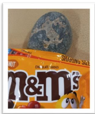
Mike’s rock trying to be an M&M peanut