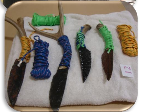
I Made It