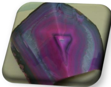
Bresyda's Bought It