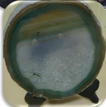
I Bought It