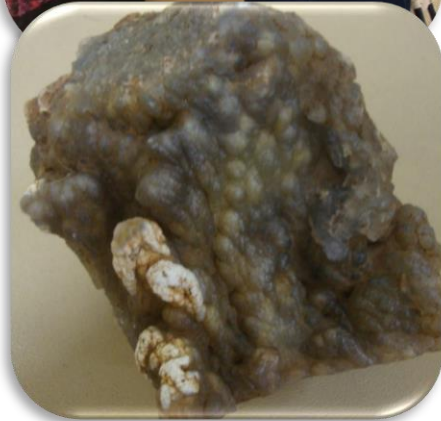
I Found It