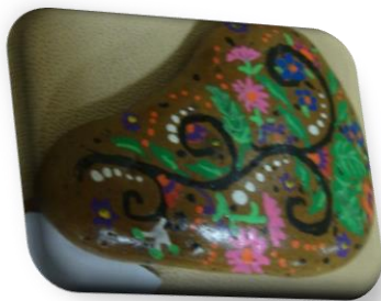
Tatyana's Found It