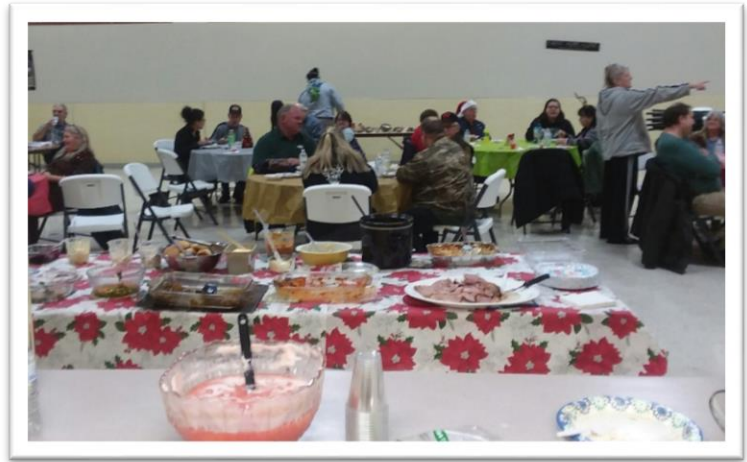
Preparing for some good eats and enjoying some good company.