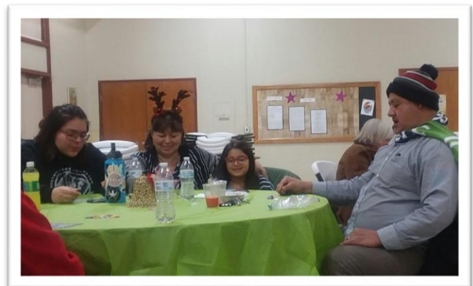
Rock BINGO always makes for a great time.